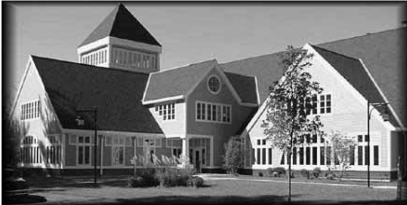
New Town Library, Carver, Massachusetts

Norfolk Ram Group, LLC (Norfolk) was retained by the Town of Carver's architects as the civil and environmental engineering consultant for improvements to the town center.