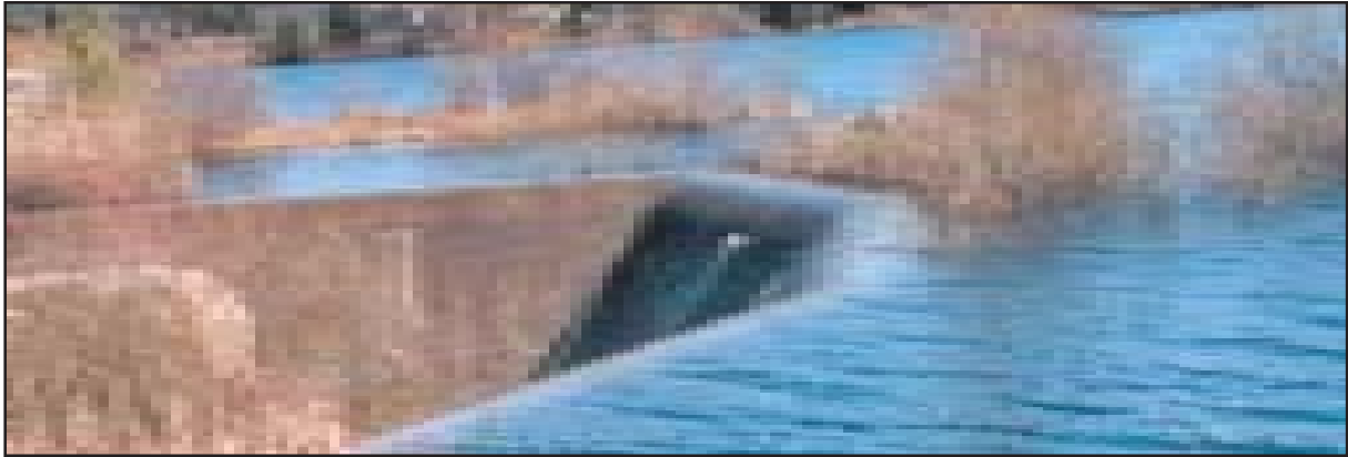
Aaron River Reservoir

Lily Pond and the Aaron River Reservoir are the sole sources for drinking water, which service approximately 7,100 people, in the Town of Cohasset. The watershed consists of approximately 9.21 miles, and is located across the communities of Cohasset, Norwell, Hingham, and Scituate. Over the years, a number of studies have been performed, which have looked at potential contamination factors, such as solid waste landfills, oil and hazardous waste releases, septic systems, road salt storage, and roadway run-off, which may be contributing to the contamination of the pond's surface and groundwater.